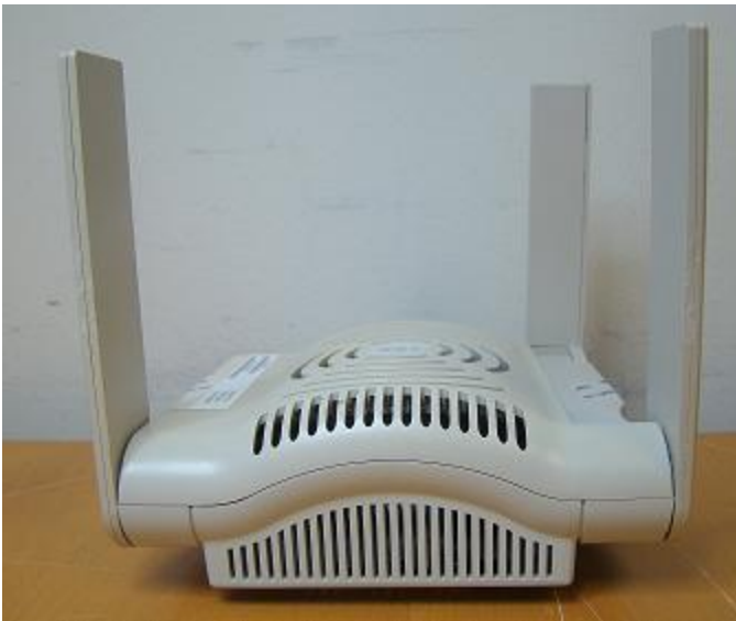
Figure 9: AP-125 Left view