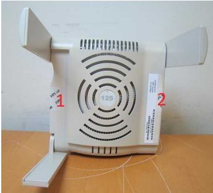
Figure 12: AP-125 Bottom view